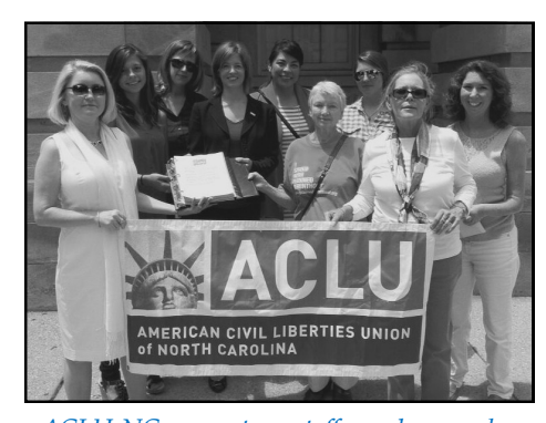
ACLU-NC supporters, staff members, and board members hand-delivered more than 7,000 signatures to Gov. Pat McCrory's office on July 23, asking the governor to "stand up for women's health by honoring your promise not to support new restrictions on abortion access"

— a promise the governor ultimately broke.