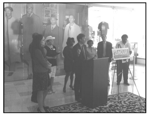
(Continued from page 1)