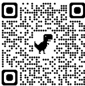
Down the ballot

We have spent the days and weeks after the election assessing the efficacy of our outreach work and are already thinking ahead to future elections. We maintain our commitment to defending and expanding voting rights in coalition with partner organizations across the state. You can look at our “Down the Ballot” resource site and Legislative Scorecard using the QR codes to the right. ■