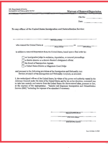
Administrative Order (ICE)

Do not lie or present any false documents. Do not sign anything without first talking to a lawyer.